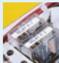
General purpose labels