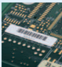
Circuit board labels