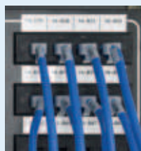
Voice & data communications