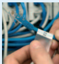
Wire marker labels & sleeves